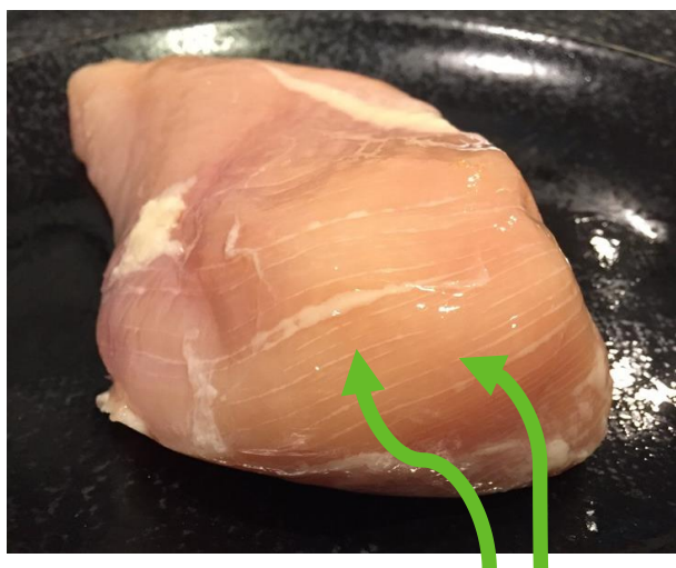
Chicken breast fillet with white striping (long fine lines where muscle fibres have turned to fat and connective tissue)