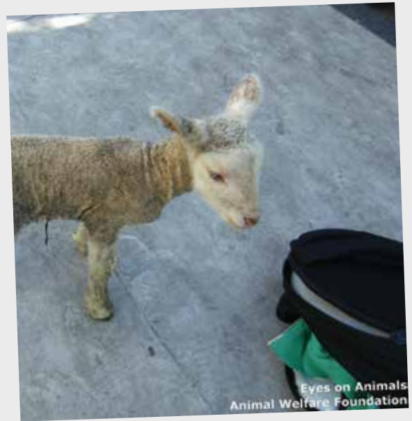
EU law prohibits the transport of heavily pregnant animals, yet this lamb was born on truck during delay at EU-Turkey border.

WE BELIEVE THAT THE EU'S INHUMANE LIVE EXPORT TRADE MUST BE BROUGHT TO AN URGENT END.