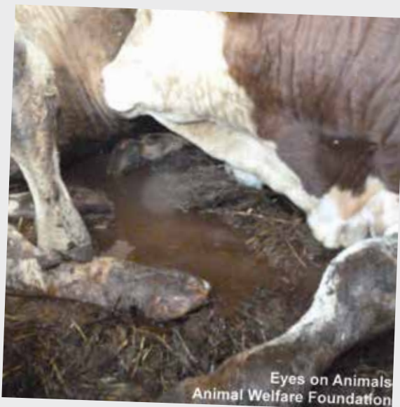
Investigation evidence exposes the suffering associated with live export trade.