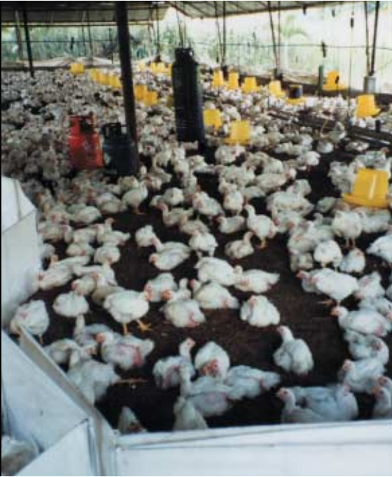
Industrial meat chicken farming is expanding to Thailand

In extensive production systems, birds are reared with little land, labour or capital, and can be accessed by even the poorest social communities in rural areas. Those are of great importance for women, especially in female-headed households. The study indicated that an average flock of 5 chickens enabled a woman in Central Tanzania to earn an additional US$38 per year or a 9.5% increase in income. Poultry raising has contributed to the 'greater empowerment of women by improving their financial status, if socio-cultural and religious environments allow it'. As such, the loss of family farming to industrial farming could seriously affect family food security, and particularly women and children.