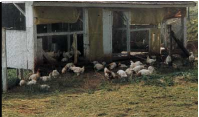
Free range meat chickens in Brazil.