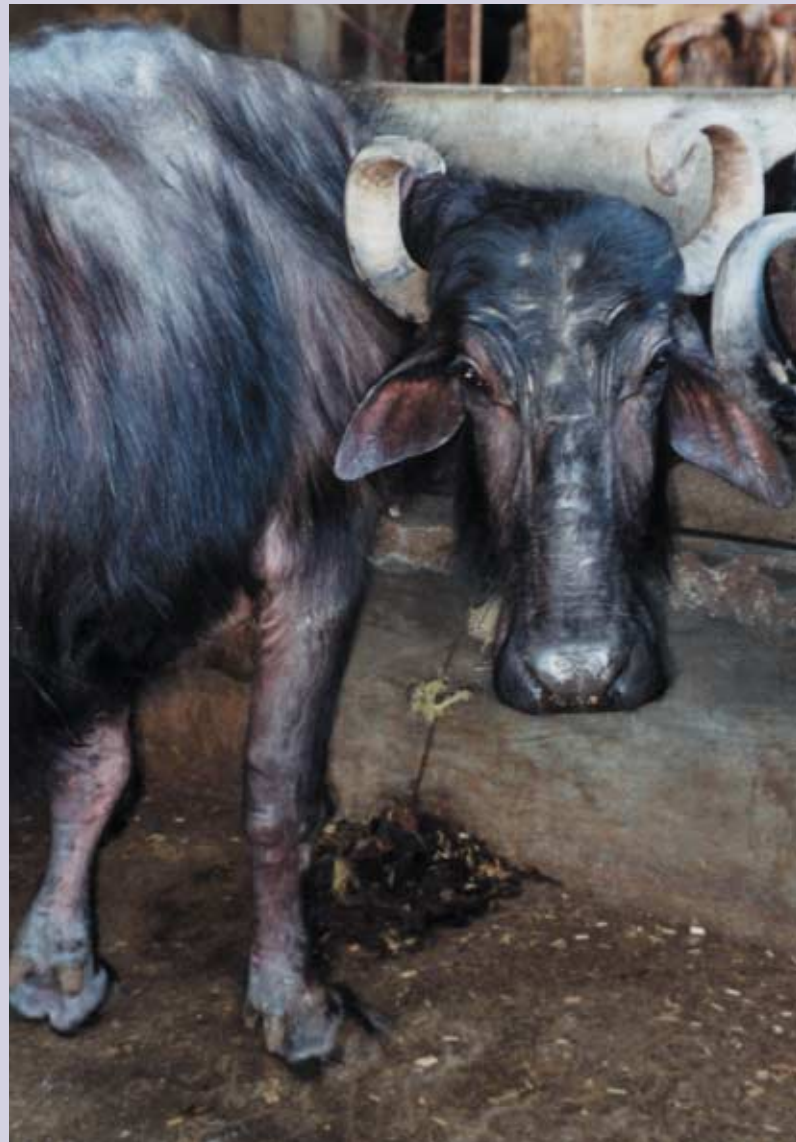
European law recognises animals are sentient beings. (Bullock in India)

Another negative impact of industrial farming is its impact on farm animal welfare. As recognised by the European Union in a Protocol to the Treaty of Rome (the EU founding document), farm animals are sentient creatures capable of feeling pain and suffering. Industrial animal farming often closely confines the animals indoors, without light and with little or no exercise. This inhibits the natural behaviour of animals, and is known to create aggression, stress and injuries. Industrial animal farming also carries out standard practices of mutilation: for example, the hen is debeaked, so that she can no longer peck her cage mate, and the pig is tail-docked, so that his bored pen mates can no longer bite his tail.