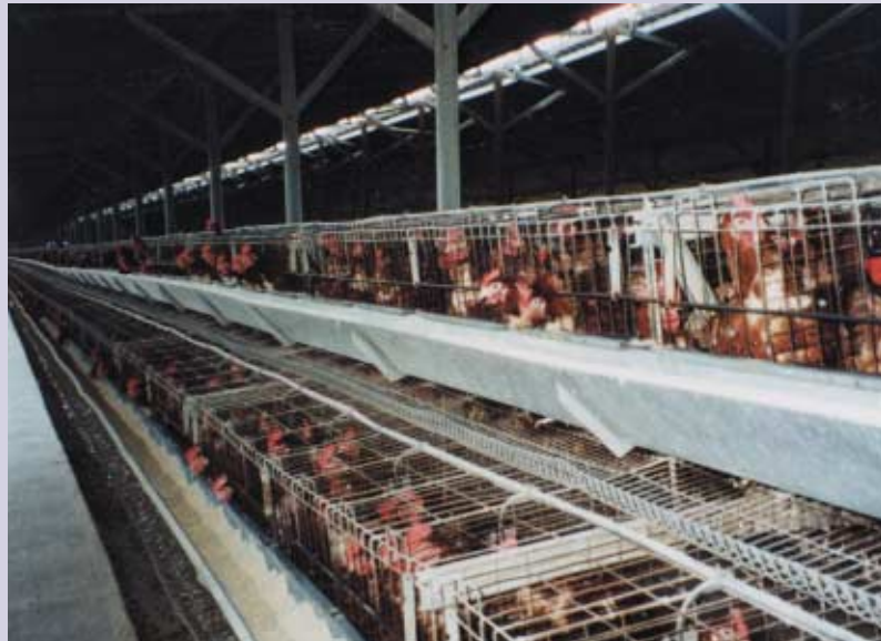
Industrially laying hens, whose meat is often sold to rural communities when they are no longer good for egg laying, South Africa.

meat in the main market. The tests revealed that the chickens were contaminated by a range of disease-causing bacteria. This kind of bacteria, if ingested, could cause severe bloody diarrhoea, vomiting, skin ulceration, abscess formation, and even typhoid fever. Gwen Dumo, a community health worker in Khayelitsha, confirmed that large numbers of people she attended complained of seemingly inexplicable bloody diarrhoea and skin ulceration problems. Furthermore this bacteria showed 100% resistance to commonly used antibiotics. This means that certain antibiotics would be useless in the treatment of people becoming sick from eating the chickens with the bacteria. It goes without saying that people with depressed immunity through AIDS or other illnesses are at particular risk from this. (CIWF South Africa 2001).