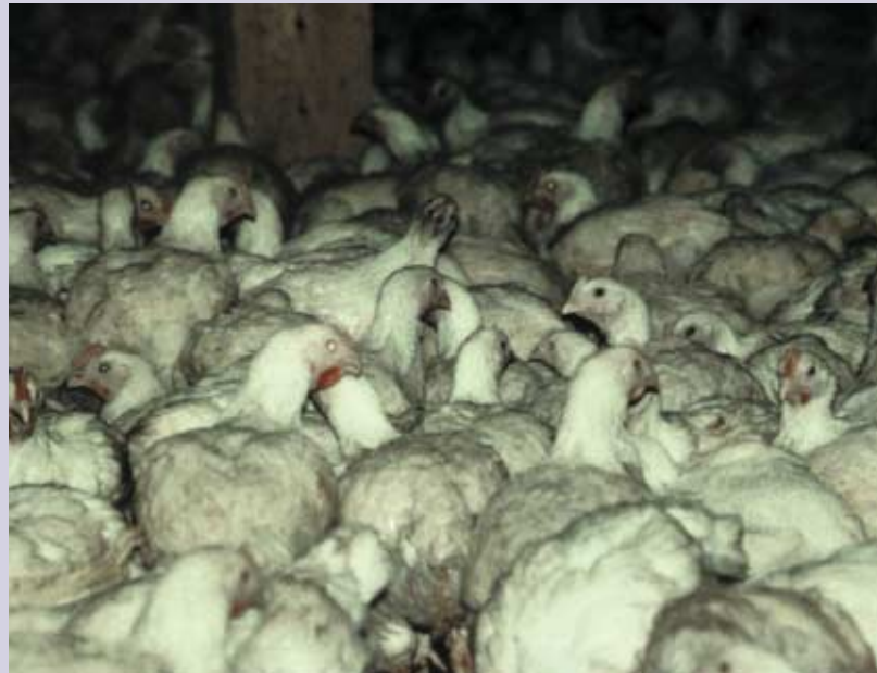
Small farmers are displaced by industrial broiler production in Brazil

The chickens were brought back to Sadia, who processed and distributed them to consumers.