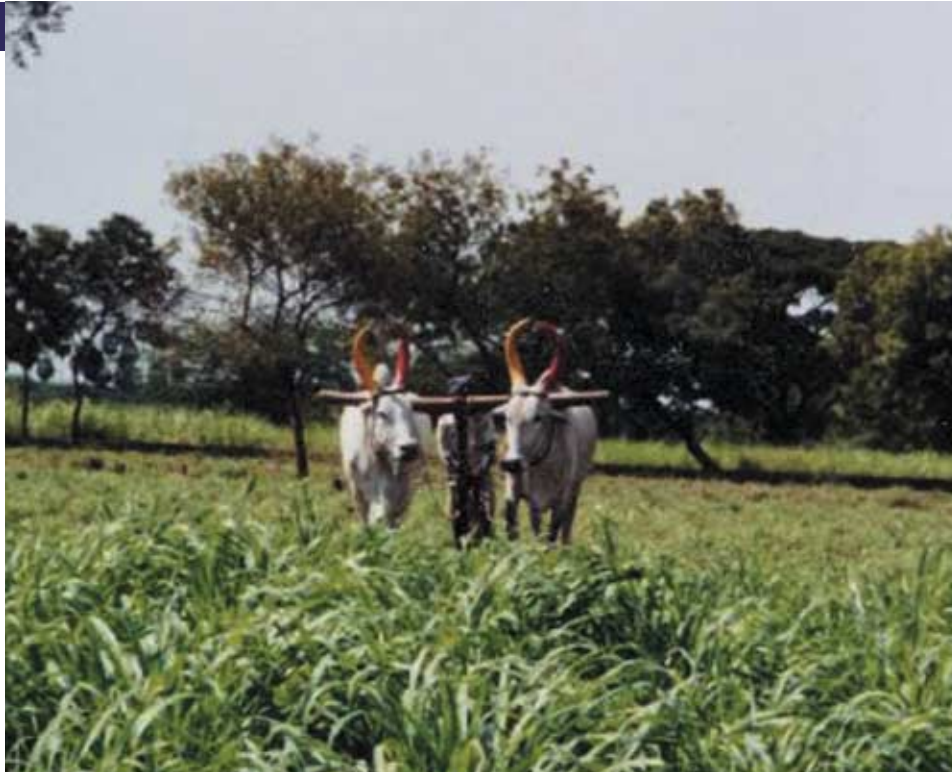
In India, oxen are valued for multiple purposes.

Two-thirds of the world's livestock are found in 'developing' countries. Most farmers in these countries practise multi-purpose, non-intensive methods of animal production. Animals are critical for their livelihoods, cultures and social status. Many of these animals graze areas not suitable for crops or scavenge freely, often consuming garbage and harmful insects. Small farms that combine livestock and crops use the land relatively sustainably: crop residues are fed to animals; manure provides good fertiliser and fuel; and animal draught power reduces the need for fuels (and associated emissions). Smallholder livestock production makes a substantial contribution to the economy and meet local food security needs.